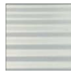
Costa Rica Silver